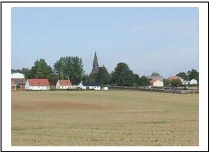
(Above right: The fighting during the time of the Battalion’s posting to Sailly-Saillisel took place on the far side of the village which was no more than a heap of rubble at the time. - photograph from 2009(?) )

The only infantry activity which was to involve the 1 st Battalion during that entire period – from the time of the action in mid-October of 1916 at Gueudecourt, until Monchy-le-Preux in April of 1917 – was to be the sharp engagement in the remnants of the village of Sailly-Saillisel at the end of February and the beginning of March, an action which was to bring this episode in the Newfoundlanders’ War – in the area of the Somme - to a close.