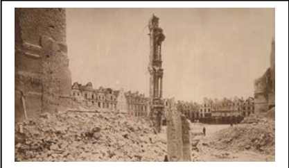
(Right above: The remnants of the Grande Place in the city of Arras in early 1916: the destruction still had over two more years to run. )

It was on March 29 that the 1 st Battalion began to make its way – on foot – from Camps-en-Amienois to the north-east towards the venerable medieval city of Arras and eventually beyond, its march to finish amid the vestiges of a village called Monchy-le-Preux.