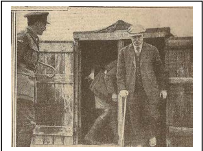
(Right above: Sir Edward Morris inspects the huts housing the Newfoundland soldiery at Meaulté. – from The War Illustrated )

After the efforts at Sailly-Saillisel, the month of March was to be a quiet time for the Newfoundlanders; having departed from the trenches, they spent their time near the communities of Meaulté and Camps-en-Amienois re-enforcing, re-organizing, and training for upcoming events. They even had the pleasure of a visit from the Regimental Band, and also one from the Prime Minister of Newfoundland, Sir Edward Morris, the latter on March 17, St. Patrick’s Day.