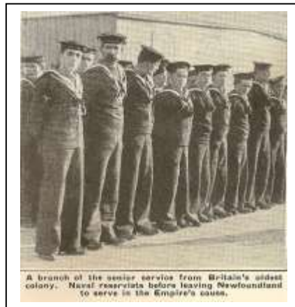
A branch of the senior service from Britain's oldest colony. Naval reservists before leaving Newfoundland to serve in the Empire's cause.

(Preceding page: H.M.S. 'Calypso' in full sail. She was to be re-named 'Briton' in 1916 when a new 'Calypso', a modern cruiser, was launched by the Royal Navy.)