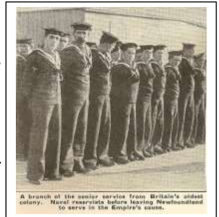
A branch of the senior corsairs from Britain's oldest colony. Naval reservists before leaving Newfoundland to serve in the Empire's cause.

Of course, the purpose of having a reserve force at any time is to provide a trained force ready at any time to serve at a time of need or crisis. Thus in August of 1914, upon the Declaration of War by the government in London, hundreds of those men of the Royal Naval Reserve (Newfoundland) were to make their way to St. John's, from there to take passage overseas to bolster the ranks of the Royal Navy.