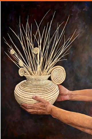
Image: Jessica Winters. Aunt Dinah's Grasswork (2022). Acrylic on rag paper. Government of Newfoundland and Labrador Collection, The Rooms.

Get access to FREE programs, parking and more by becoming a Rooms Member!