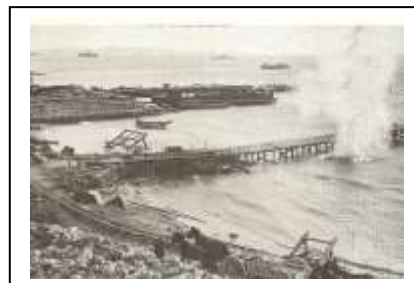
(Right: 'W' Beach at Cape Helles under shell-fire only days before the final British evacuation )

Immediately after the British evacuation of the Gallipoli Peninsula , the Newfoundland unit had been ordered to the Egyptian port-city of Alexandria and beyond.