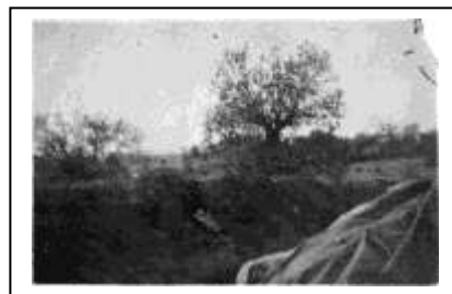
(Right: No-Man's-Land at Suvla Bay as seen from the Newfoundland positions )

By this time the situation there had daily been becoming more and more untenable, thus on the night of December 19-20, the British had abandoned the entire area of Suvla Bay – the Newfoundlanders, the only non-British unit to serve there, to form a part of the rear-guard.