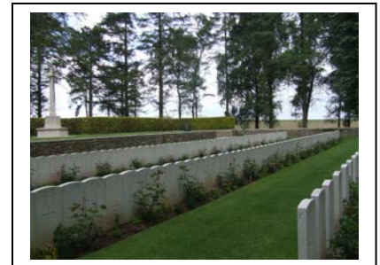
(Right: A view of Hawthorn Ridge Cemetery Number 2 in the Newfoundland Memorial Park at Beaumont-Hamel – photograph from 2009(?))

*Perhaps ironically, the majority of the Battalion’s casualties was to be incurred during the advance from the third line of British trenches to the first line from where the attack proper was to be made, and while struggling through British wire laid to protect the British positions from any German attack.