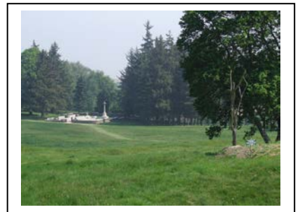
(Right above: Beaumont-Hamel: Looking from the British lines down the hill to Y Ravine Cemetery which today stands atop part of the German front-line defences: The Danger Tree is to the right in the photograph. – photograph taken in 2009)

If there is one name and date in Newfoundland history which is etched in the collective once-national memory, it is that of Beaumont-Hamel on July 1 of 1916; and if any numbers are remembered, they are those of the eight-hundred who went over the top in the third wave of the attack on that morning, and of the sixty-eight unwounded present at muster some twenty-four hours later*.