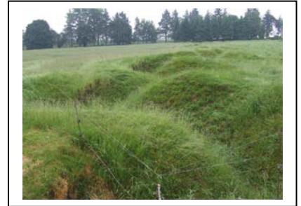
(Right: A part of the re-constructed trench system to be found in the Newfoundland Memorial Park at Beaumont-Hamel – photograph from 2009(?))

*It should be said that the Newfoundland Battalion and two-hundred men of the Bermuda Rifles who were serving at the time in the 2 nd Lincolnshire Regiment Battalion, were then the only units at the Somme from outside the British Isles - true also on the day of the attack on July 1.