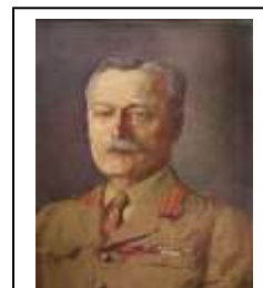
(Right: Haig, Commander-in-Chief of the British Expeditionary Force at the time of the Battalion's posting to GHQ –)

The Newfoundland Battalion had remained posted at St-Josse until May 10 when it had then marched a further six kilometres inland to the south-east to the community of Écuire. There it was to relieve the troops responsible for the safety and security of the nearby British General Headquarters at Montreuil-sur-Mer and of Douglas Haig, the Commander-in-Chief of the British Expeditionary Force in Europe.