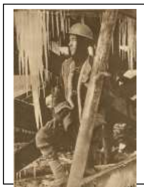
(Right: A soldier of the Lancashire Fusiliers, his unit to be relieved by the Newfoundlanders on March 1, enjoys his cigarette in the cold of the trenches at Sailly-Saillisel during the winter of 1916-1917.)

This period had also provided the opportunity to undergo training and familiarization with the new practices and the recent weaponry of war; in the case of the Newfoundland Battalion these exercises had been at least partially undertaken from February 4 to 18 in the vicinity of the communities of Carnoy and Coisy.