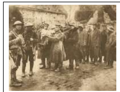
(Right above: British troops and their German prisoners in Flanders during the Hundred Days Offensive)

On September 28, the Belgian Army and the 2 nd British Army broke out of their positions and overran the enemy lines. It was the start, for them, of the Hundred Days Offensive *. On the following day, the Newfoundlanders were fighting at the Keiberg Ridge . After almost four years of stalemate, the Great War on the Western Front was once again to be a conflict of movement.