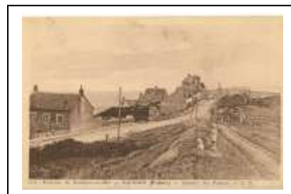
(Right: The sparsely-populated community of Équihen at or about the time of the Great War – from a vintage post-card)

The posting to Écuire completed, for most of July and all of August the Newfoundlanders had been encamped in much the same area, close to the coastal village of Équihen* – itself not far removed from the large Channel port of Boulogne – and far to the rear of the fighting, of which there had been plenty elsewhere.