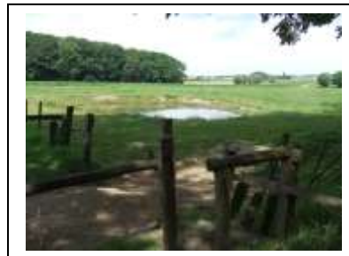
(Right above: Some of the farmland in the area of Messines, a mine crater from the time of the 1917 British offensive in the foreground – photograph from 2014 )

Having reached the Ploegsteert area, there the 2 nd Battalion would remain – as did the entire Canadian Division. In the next months it came to be well-acquainted with the Franco-Belgian area between Armentières in the east – any further east would have been in German-occupied territory – Bailleul in the west, and Messines in the north; given the route marches enumerated in the War Diary and the itineraries used, it would have been surprising had it been otherwise.