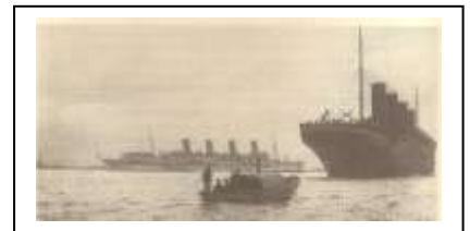
(Right above: HMT Olympic, on the right, lies at anchor along with HMHS Aquitania, centre, at Mudros Bay in the autumn of 1915.)