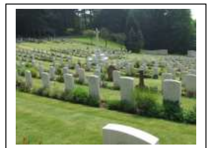
(Right above: Little remains of Shorncliffe Military Camp today apart from a barracks occupied by Gurkha troops. The Military Cemetery almost alone serves as a reminder of the events of a century ago. – photograph from 2016 )

The following few days were hectic for Private Applin and presumably for his entire unit: on December 28 the Company was either en route or had arrived in the county of Kent, at Shorncliffe Camp near Folkestone where he was taken on strength of the 92 nd Battalion; a week later, on January 1, he was transferred to Bramshott Camp in Hampshire to be transferred to the 5 th Reserve Battalion; sixteen days later again he was ordered to the not-too-distant Shoreham Army Camp on the Sussex coast where he was attached to the 20 th Reserve Battalion.